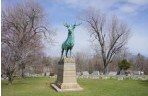
Elks Rests in New Orleans and in Buffalo, New York.

Now , take a short walk around the roundabout to the large Soldiers Memorial. It is the large, triptych-style monument across the road.